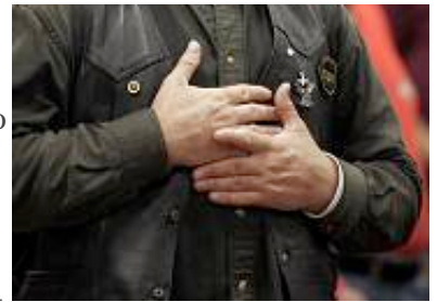
Rally to Ridgecrest share in praise and worship, led by a worship team from Thompson Station (Tenn.) Baptist Church, after a day of biking through North Carolina's Blue Ridge Mountains.

Original copy of this story can be found at http://www.bpnews.net/bpnews.asp?ID=30606