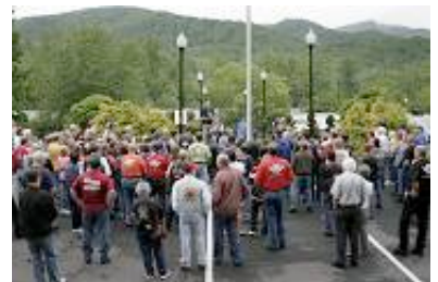
Motorcycle enthusiasts at the Rally to Ridgecrest gather for a wreath-laying ceremony at a veterans' cemetery, an annual part of the gathering of motorcycle enthusiasts in North Carolina's Blue Ridge Mountains.